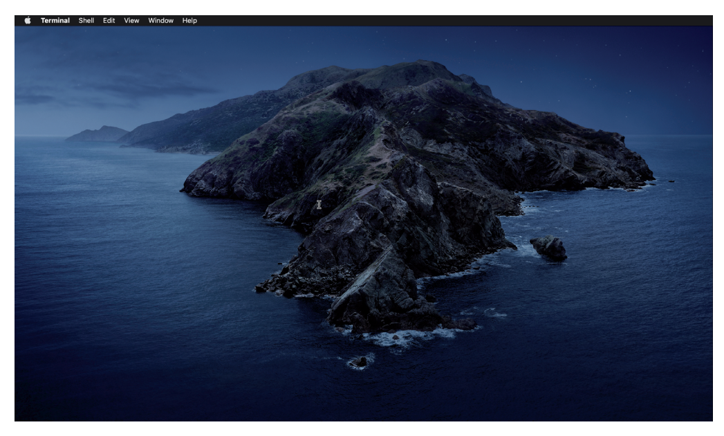
Figure 3: A screenshot, via WindTape.

Note: On recent versions of macOS, when an application (e.g. WindTape) attempts to capture a screenshot (even via the screencapture utility) a system 'permissions' prompt will be shown to the user. And, unless the user explicitly affords the application this permission (via macOS's System Preferences), a full screen capture cannot be obtained.