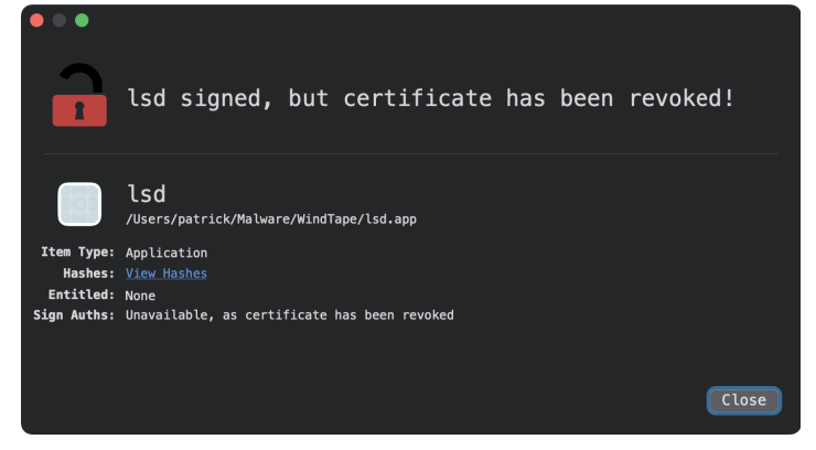
Figure 1: WindTape's code signing status (via 'What's Your Sign').

First, let's determine the malware's file type, as many analysis tools are file type specific. Using Objective-See 's free 'What's Your Sign' utility [6], we can see that it's a standard macOS application (note: Item Type: Application).