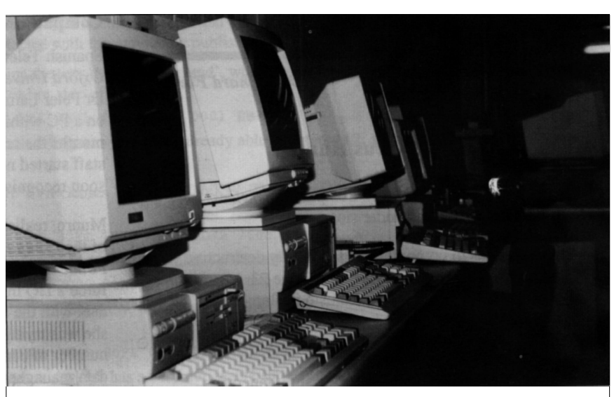
An enormous range of platforms and a fragmented structure consisting of more than thirty independent colleges and a similar number of academic departments combine to make virus suppression at Oxford University a daunting task.

OUCS negotiated University-wide site licences for Sophos' Sweep and McAfee's Validate , joined the VIRUS- L electronic conference and subscribed to Virus Bulletin . Help is available any weekday during office hours via the University's own internal telephone system and over