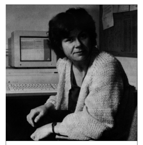
Munro: "We find ourselves recovering data from about ten machines every fortnight - that takes a lot of time".

Problems remain despite an intensive and ongoing education program. OUCS has had its share of pseudo-virus infections; the "Incidentally, I typed DEL *.* in the root directory" scenario is well