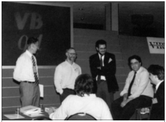
The conference wasn't all play, play, play. Speakers and delegates settle down to some serious arguments about the future of the industry.

Friday started somewhat later than the first day of the conference - after the late-night gala dinner, most people were pleased to have an extra hour's sleep!