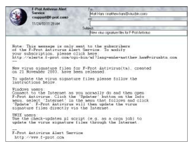
Email alert from F-Prot Antivirus Alert Service.

Since this had been a rather more complex, and failureridden process when performed on previous versions of F-Prot for Linux , this was a good sign. The behaviour of the