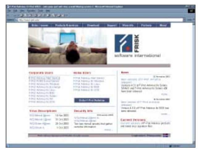
F-Prot's website – a romantic moment with a laptop?

Having been subscribed to these alerts for one week, I received a total of three alerts: two notifications of new