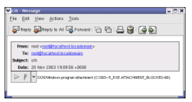
The somewhat strange re-naming of a 'blocked' attachment.

As for treatment of detected files, this is the most interesting area in as much as the options available are rather different in detail from those that are often encountered. The division of the definition files into 'macro' and 'other' seems to be followed here too. For example, deletion is available for files other than those containing macros. In the case of macro viruses the file may be disinfected or have all macros purged, but total deletion is not available as an option. The reason given for this is so that work is not lost. It might be