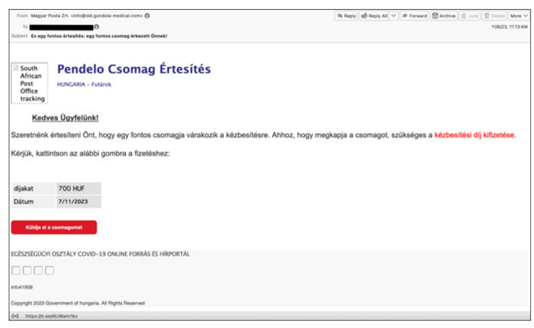
Hungarian phishing sample.