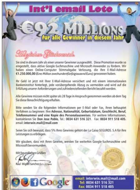
Figure 2: German lotto scam.

One was an email in German, congratulating the recipient on winning €1,250,000 in an email lottery. Of course, payment of a fee was required in order to claim the money, which is how the scam works. With the content embedded as an image, it is perhaps not surprising that products found it hard to block the email.