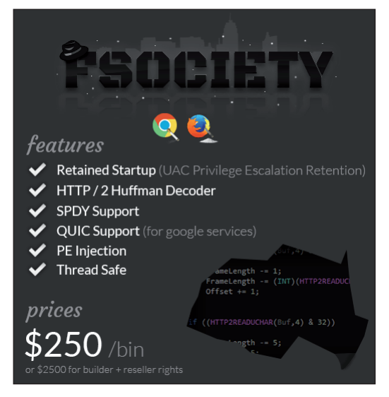
Figure 1: Advertisement for an advanced banking trojan.

features that would lead to a large botnet, but their authenticity is questionable and their perceived reputation depends on the advertiser. In Figure 1 we show an example of a relatively recent, unverified, offer from October 2016.