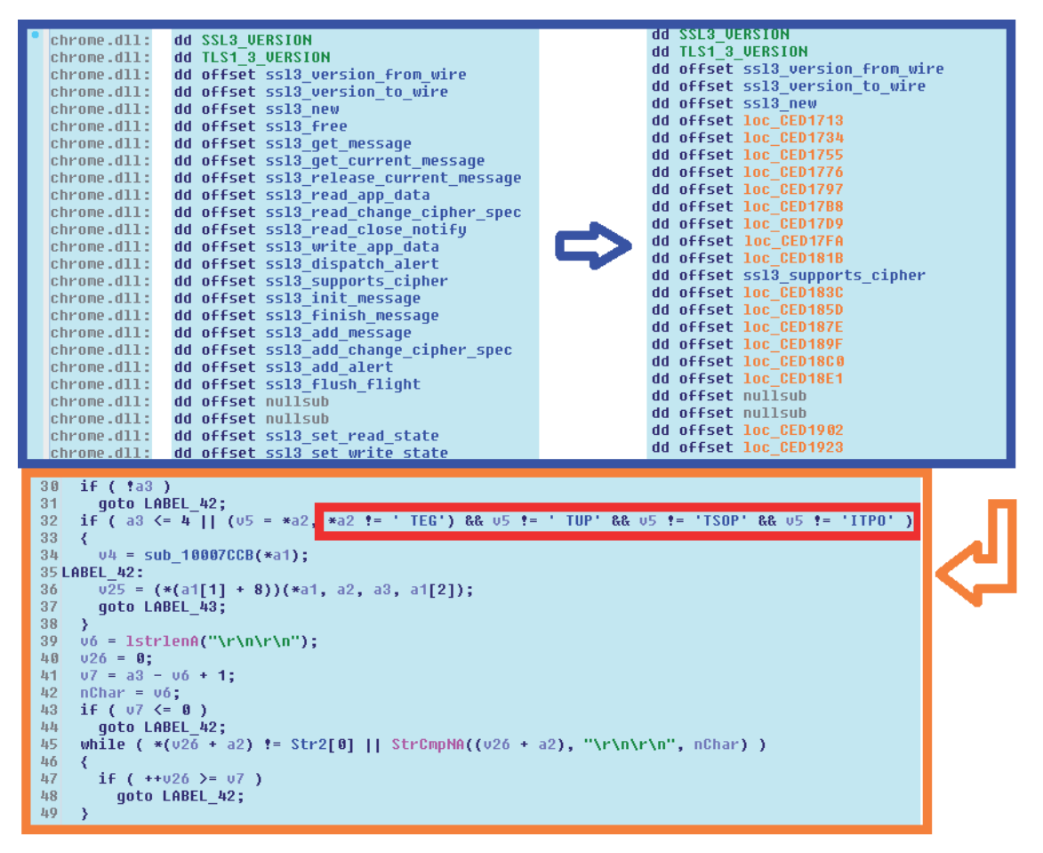
Figure 5: Almost every Chrome virtual method is initially hooked by IFSB.

targets countries like Mexico, Colombia and Chile. The family can be identified by the PDB strings: