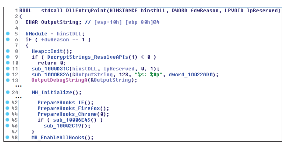
Figure 7: Hooks are prepared by Win/Qbot for every browser, regardless of the process name.